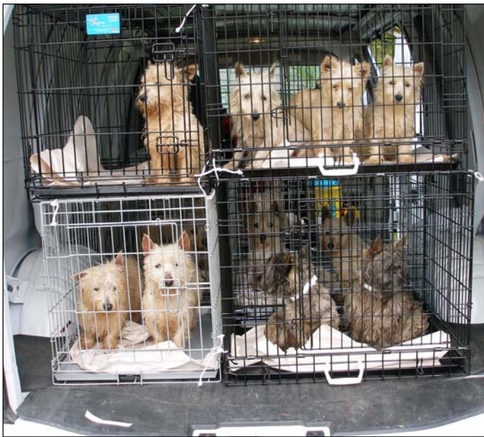
Westies and Cairns rescued from a Missouri puppy mill find their way to Northern Virginia and to Westie Rescue volunteers, an image repeated many times in the past years.

Sonny our 1,000th Westie rescued was an older guy, whose owner returned home to England to care for dying family members. His best buddy of 12 years would not have survived the 6 months of mandatory quarantine if he traveled with his owner. With lots of tears and worry, Sonny was given to us to find not any home, but a GREAT one. Early on Thanksgiving morning, I drove to North Carolina to meet Sonny's new owner, who was looking for a partner to watch football games together. Sonny jumped into the front passenger seat of her car as if to say "Hey, let's have a snack and get on the road!" Sonny has moved in to her heart and home wearing a Panther team shirt, laying belly side up, as the game plays in the background. Both are real happy with the arrangement.