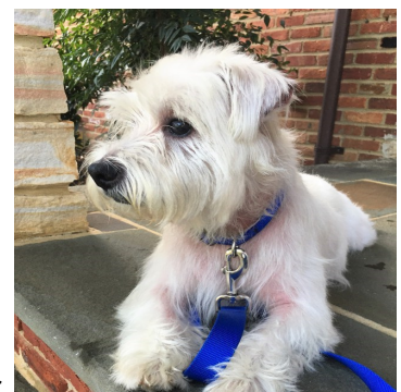
Nipsey (aka Dudley)

There is even more good news for Nipsey. His foster mom has adopted him and named him Dudley ("Nipsey" gave people the wrong impression about his sweet nature). His biggest challenge now is sparring over toys with his Scottie sister.