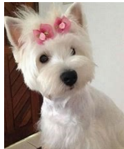
Behavior Training Who? Me?

The Covid-19 pandemic continued to impact Westie owners ability to care for their dogs. Some Westie owners died or had to move into assisted living thus requiring their best buddies to seek new homes and lives. Some people moved to find jobs and could not take their Westie with them. Some people's Westies had medical issues their owners did not know how to treat or where to go to get treatment. Some owners had a Westie with attitude issues from being the prince or princess of their household.