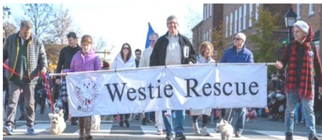
Alexandria Virginia Scottish Christmas Parade

Although we were present at several events, Covid still hampered our efforts to promote adoption by letting people see real, live Westies.